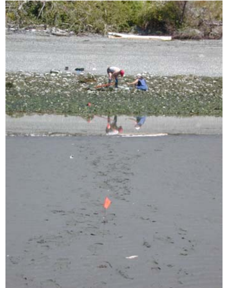
Point Whitehorn/Cherry Point 2005 Clam Survey-# of Clams by Transect & Type

The table and charts below provide a description of the types and numbers of clams that were found at each transect and overall.