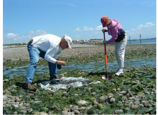
Birch Point 2005 Clam Survey- Number of Clams by Transect and Type

The table and charts below provide a description of the types and numbers of clams that were found at each transect and overall.